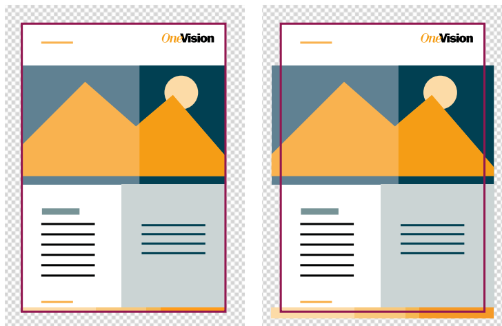
Print file is supplied without bleed